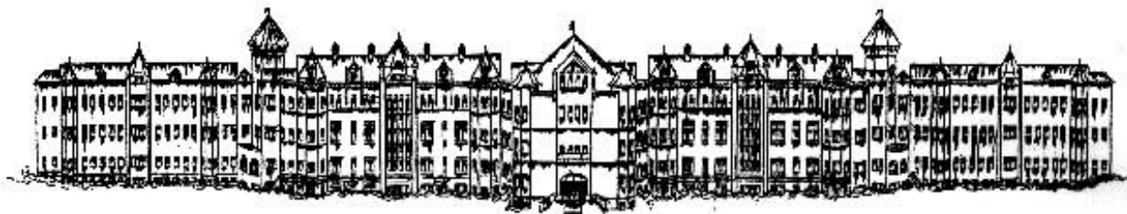
Illustration of Patton State Hospital Circa 1902 Based on a Lithograph by Vern Fowler

Patton State Hospital has provided mental health treatment since 1893 and has been accredited as a forensic mental health facility by the Joint Commission on Accreditation of Healthcare Organizations (JCAHO) since 1987. It is the largest maximum-security forensic hospital in the nation that houses male and female criminally insane patients. Patton has a long and interesting history that dates back to 1893 when the hospital was first opened as the "Highland Insane Asylum."